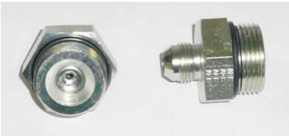
Pump fitting with orifice